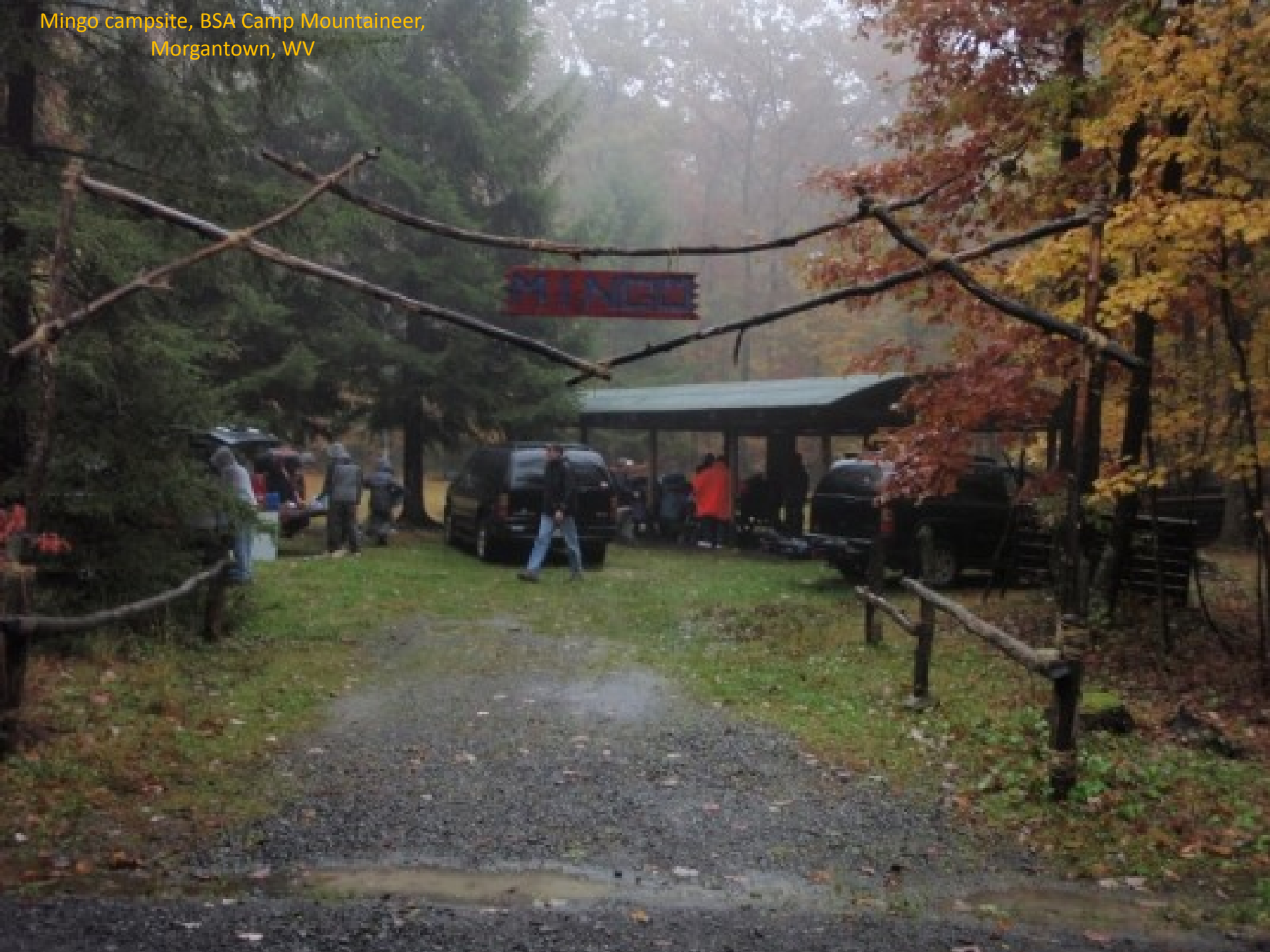
Mingo campsite, BSA Camp Mountaineer, Morgantown, WV