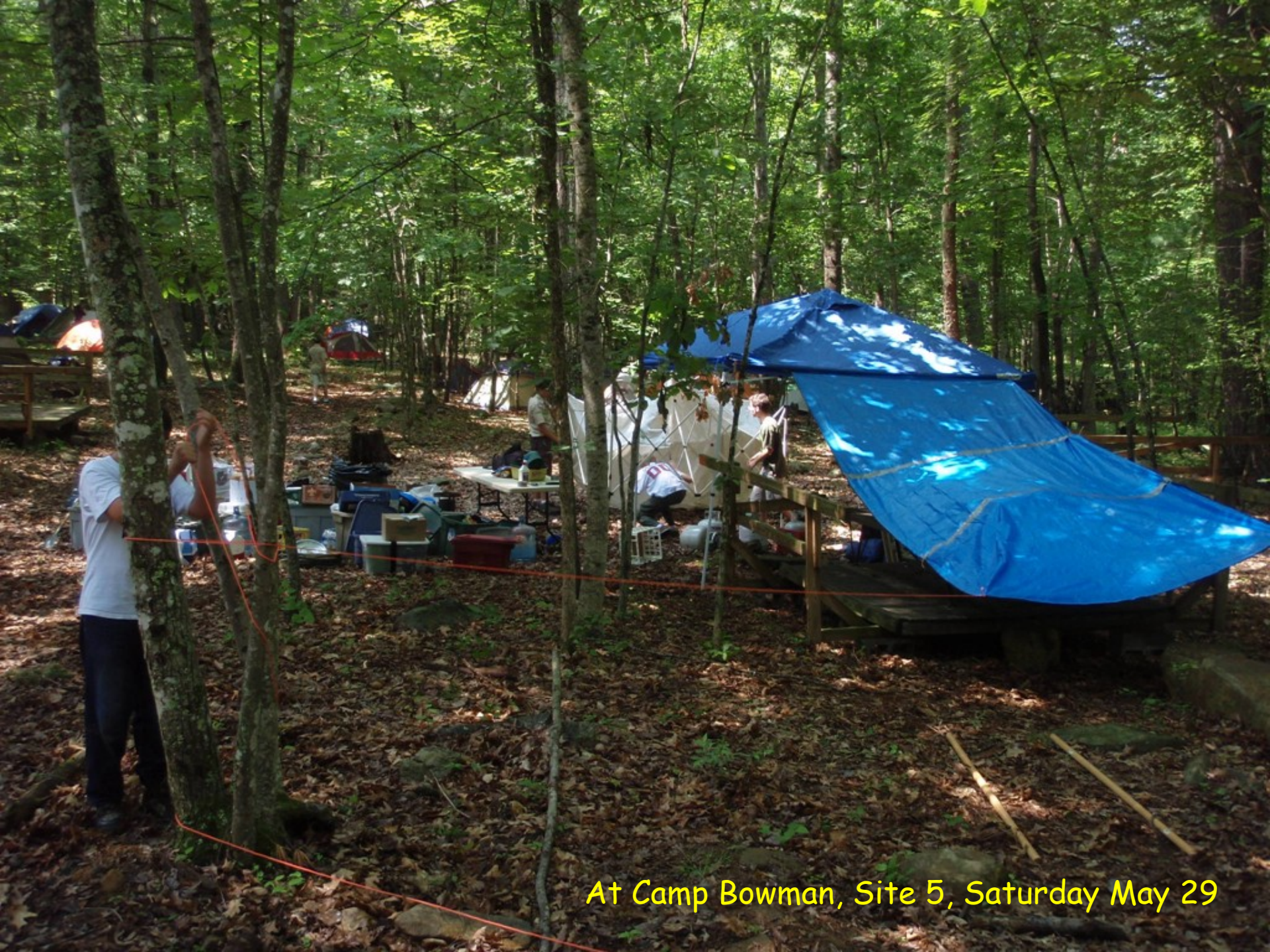
At Camp Bowman, Site 5, Saturday May 29