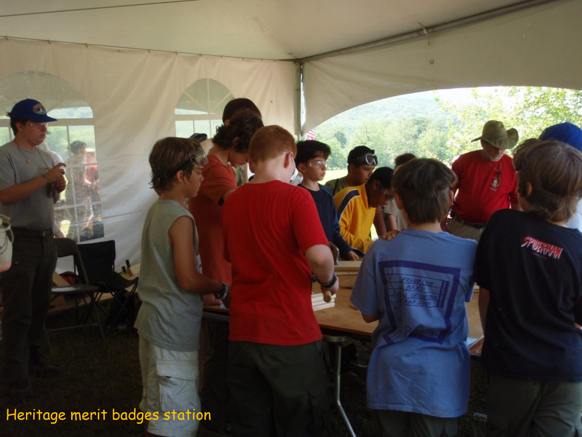
Heritage merit badges station