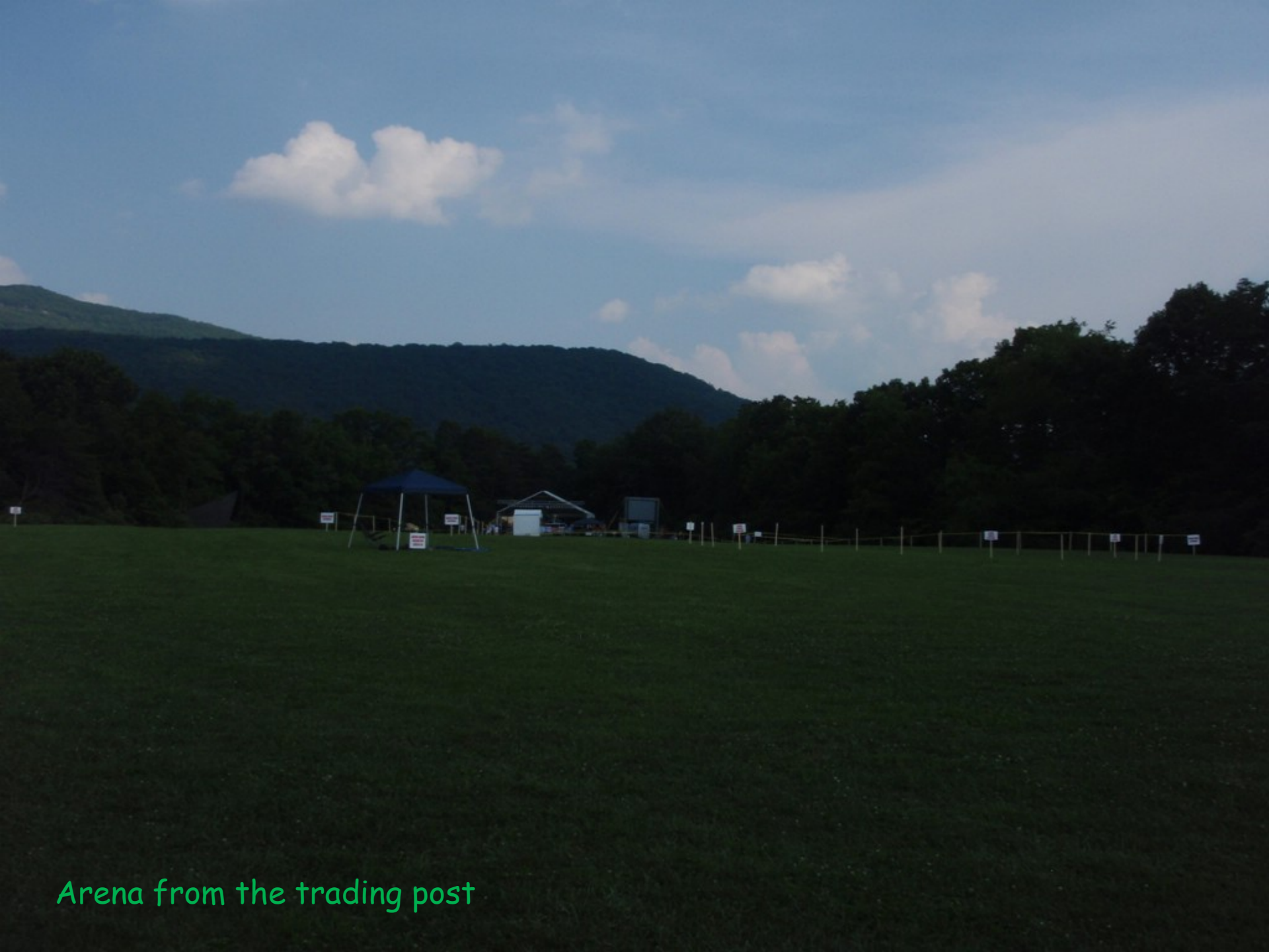
Arena from the trading post