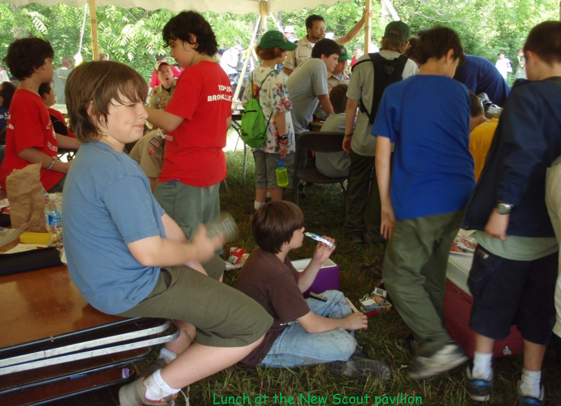
Lunch at the New Scout pavilion