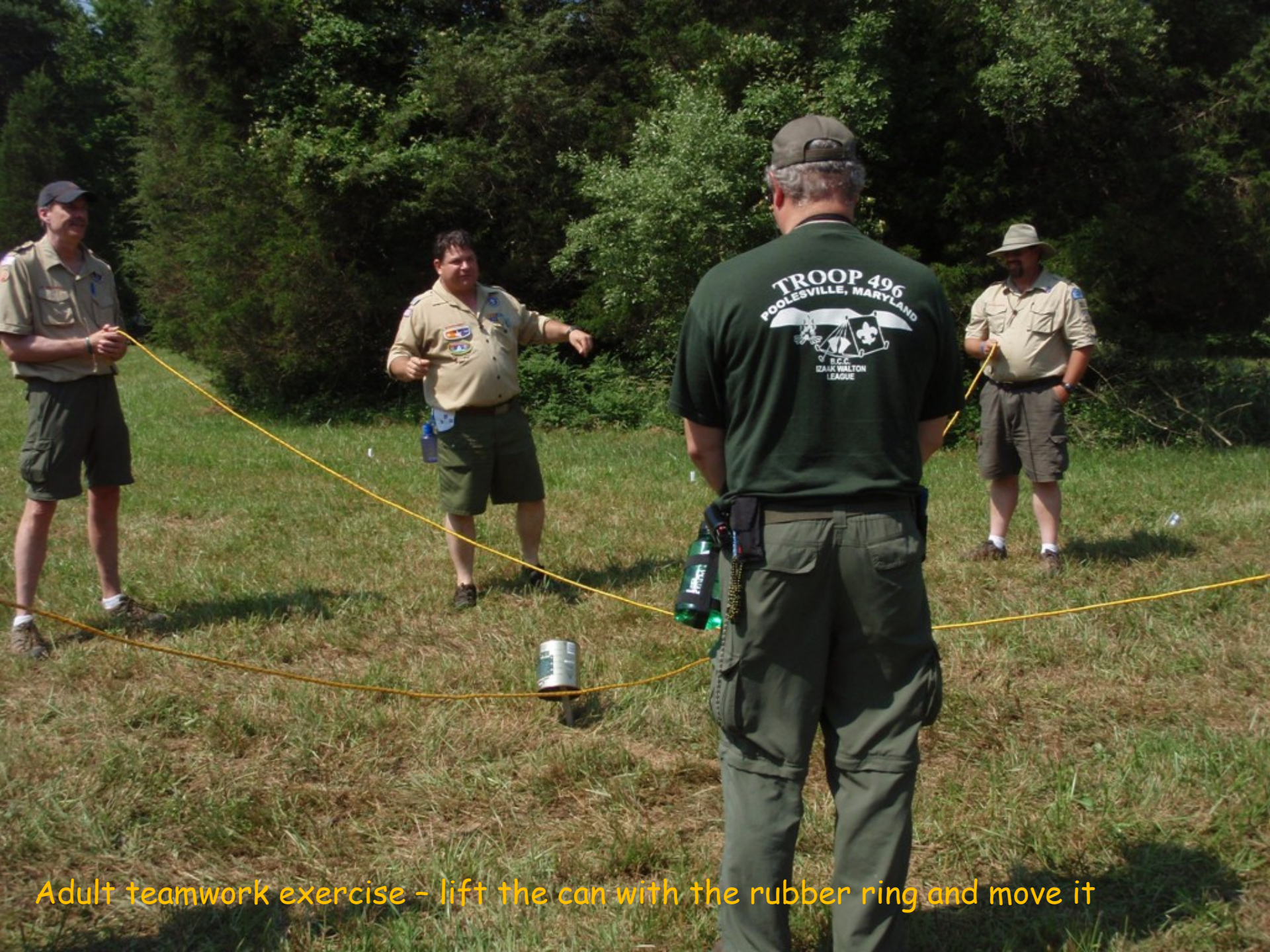
Adult teamwork exercise - lift the can with the rubber ring and move it