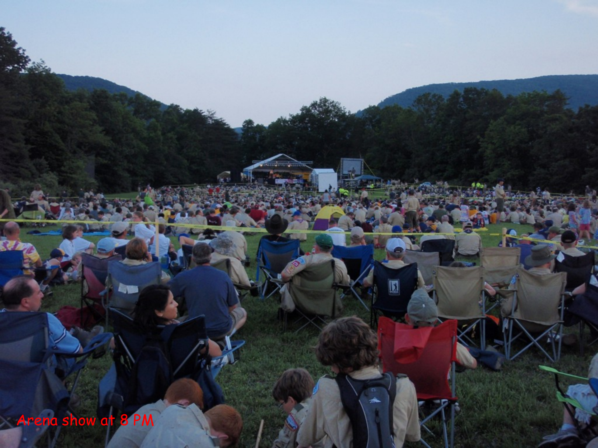
Arena show at 8 PM