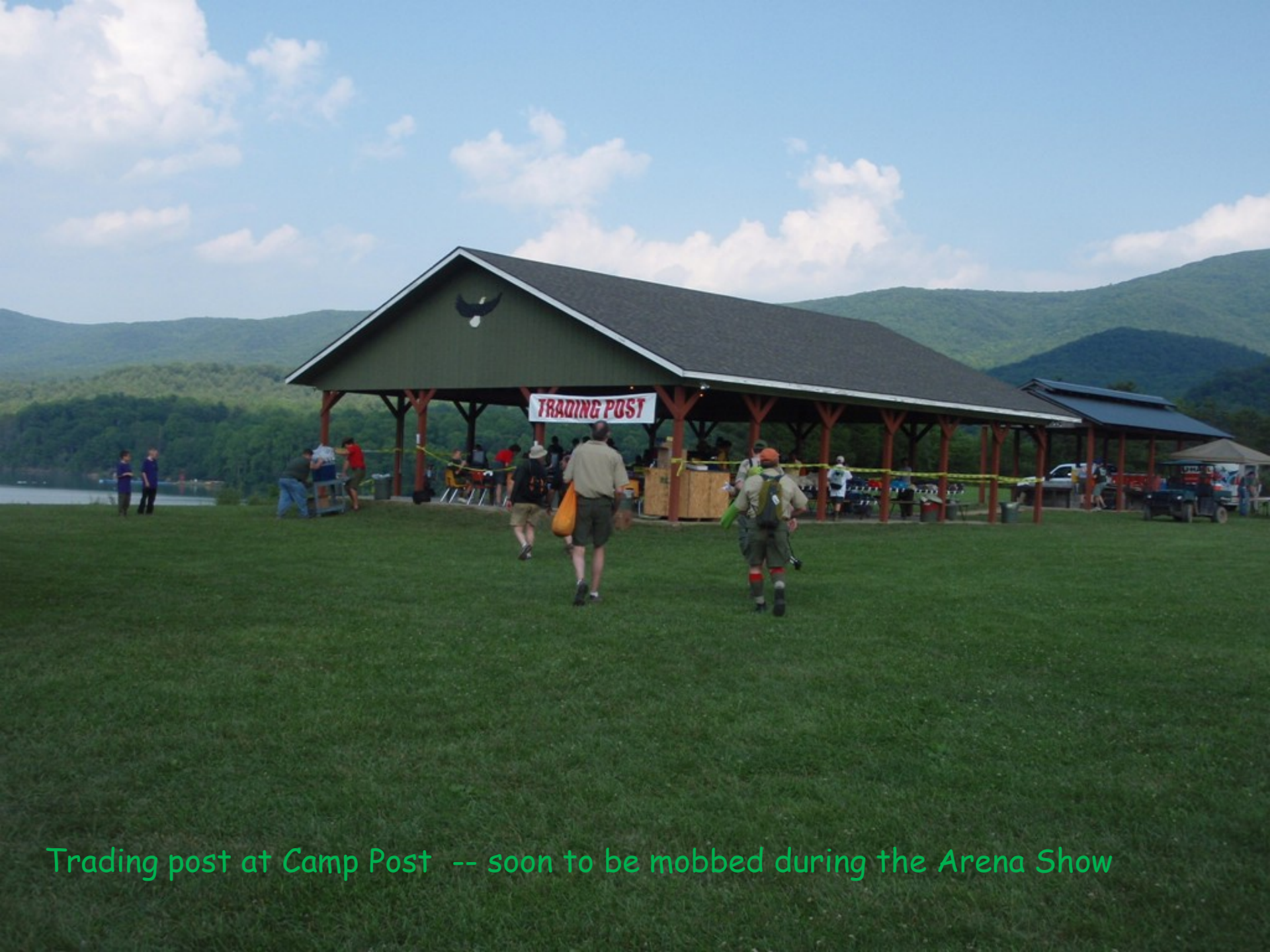
Trading post at Camp Post -- soon to be mobbed during the Arena Show