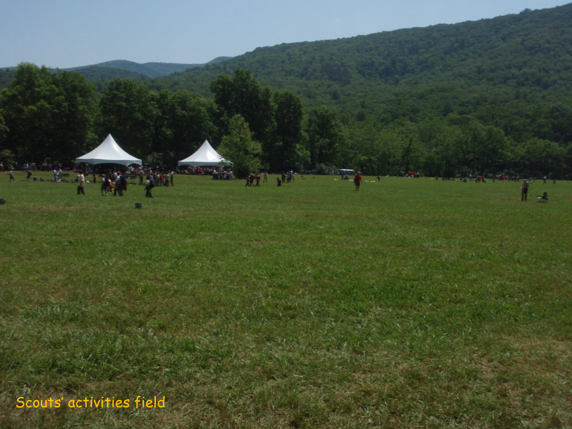
Scouts' activities field