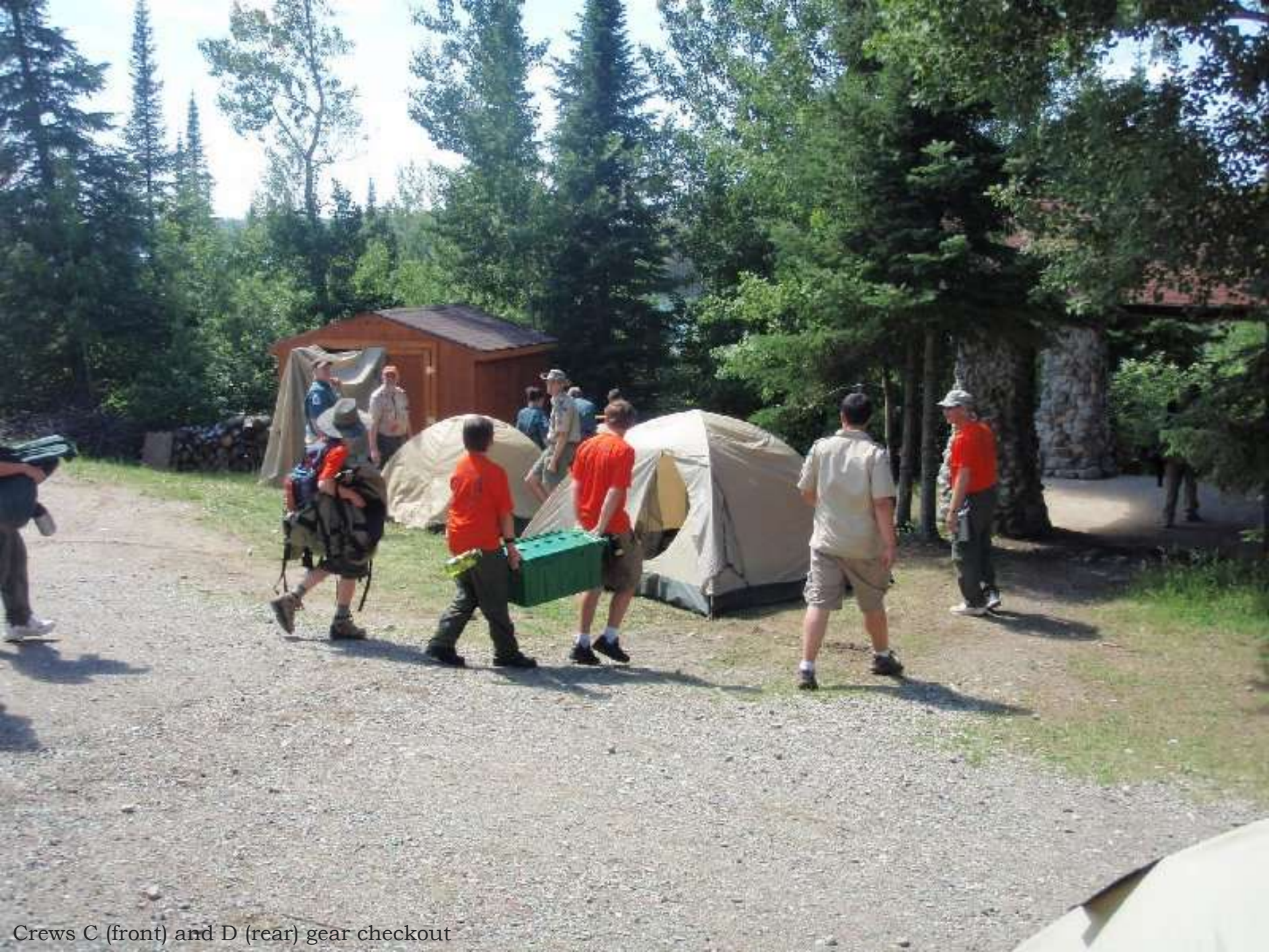
Crews C (front) and D (rear) gear checkout