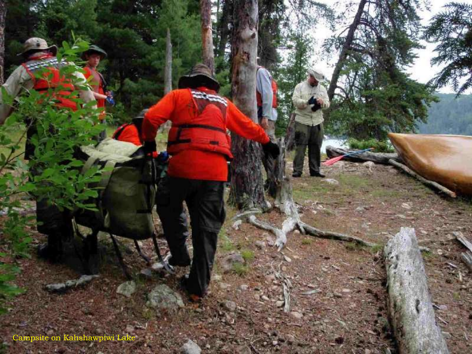
Campsite on Kahshawpiwi Lake