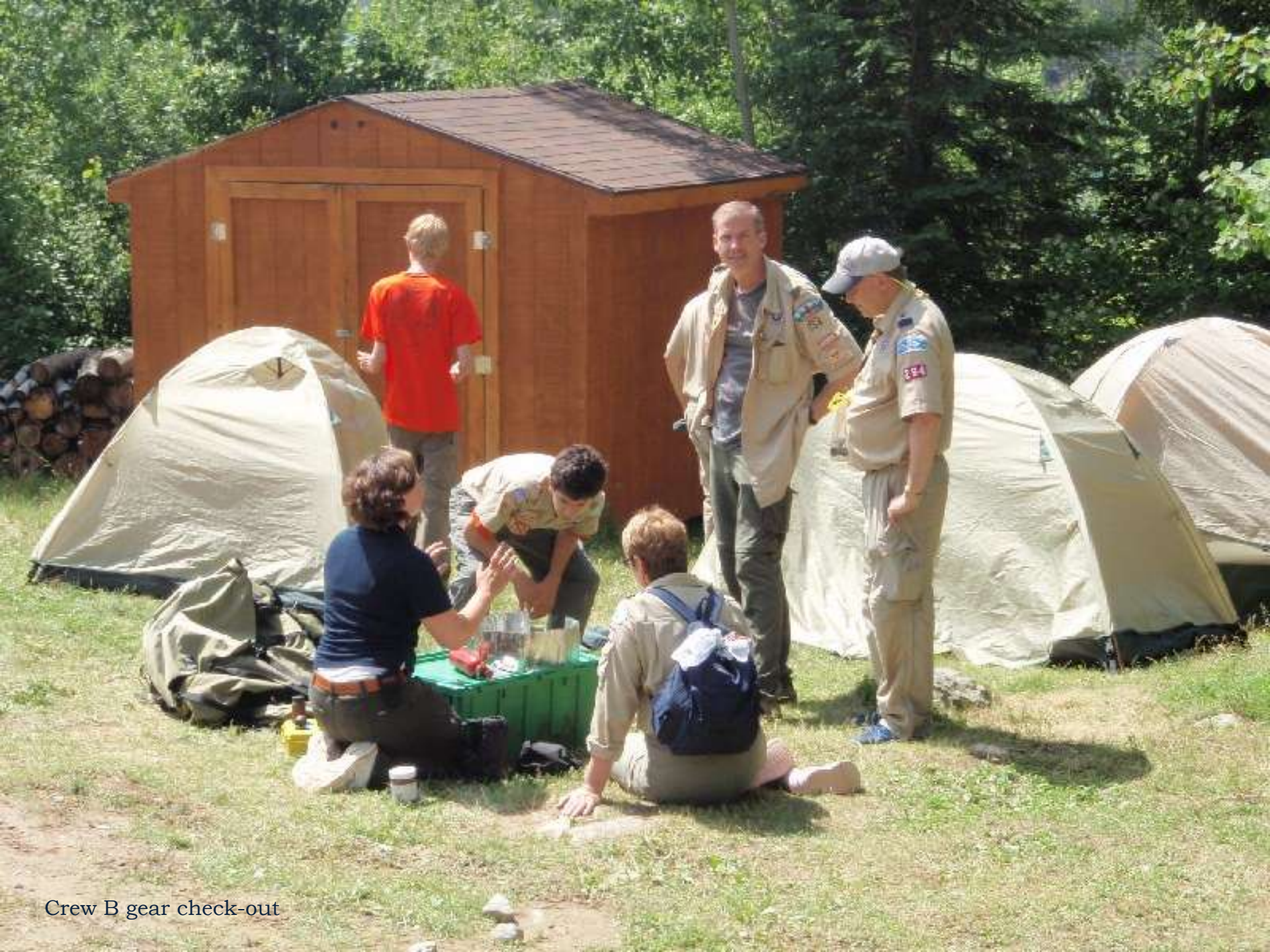
Crew B gear check-out