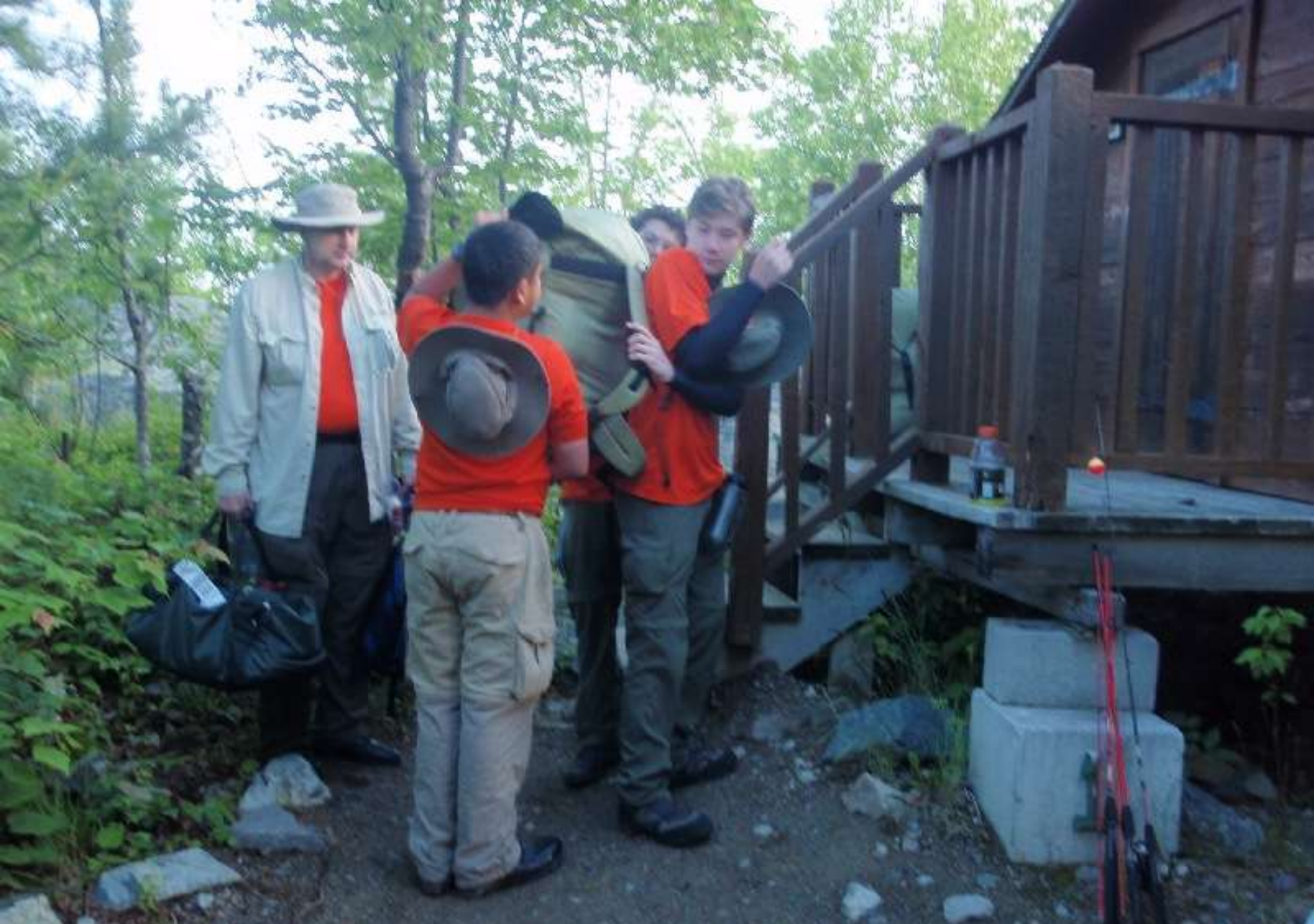
June 29 – Loading up, to breakfast!