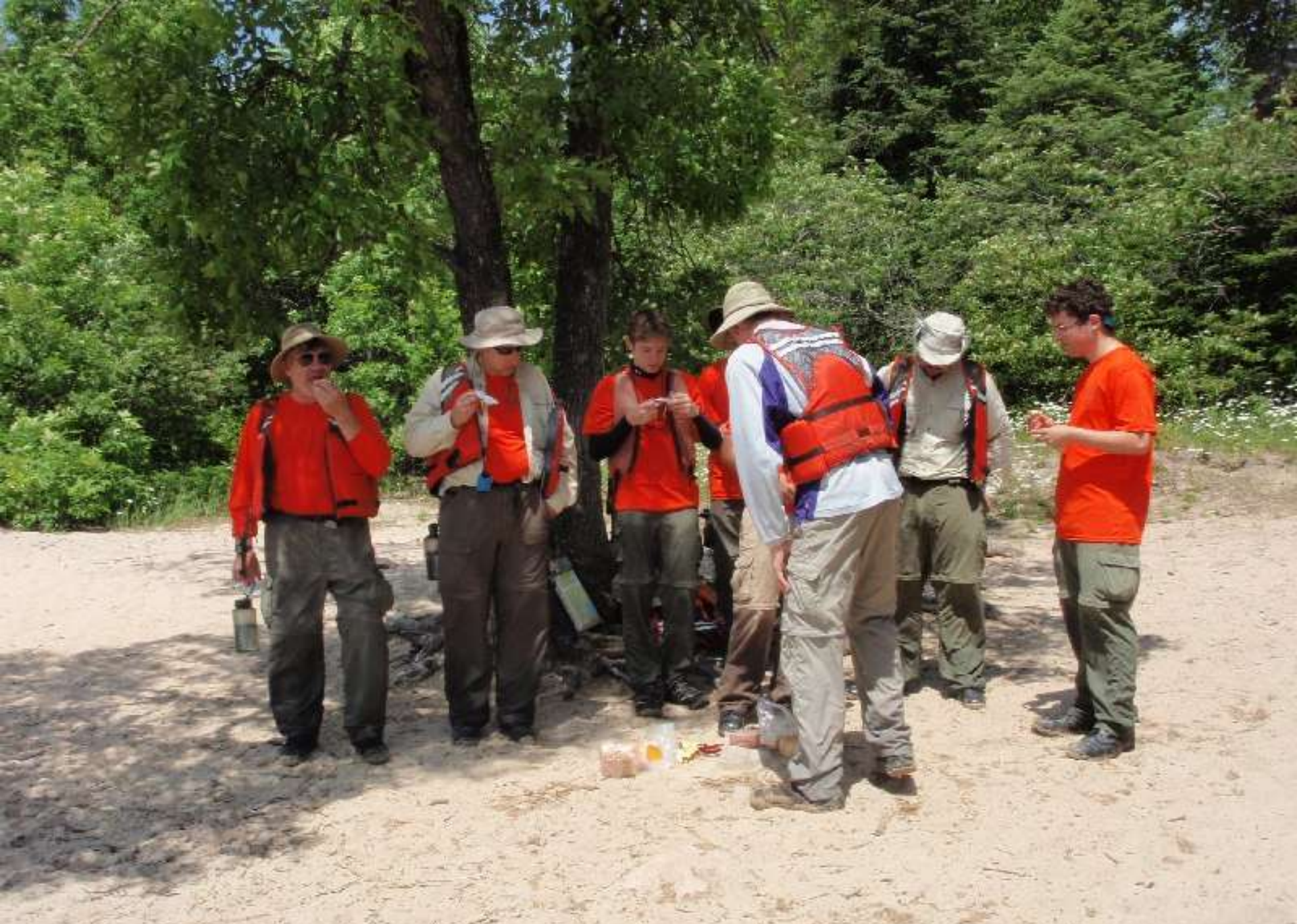
“Yellow Brick Road” ... a rare sand beach. Lunchtime!