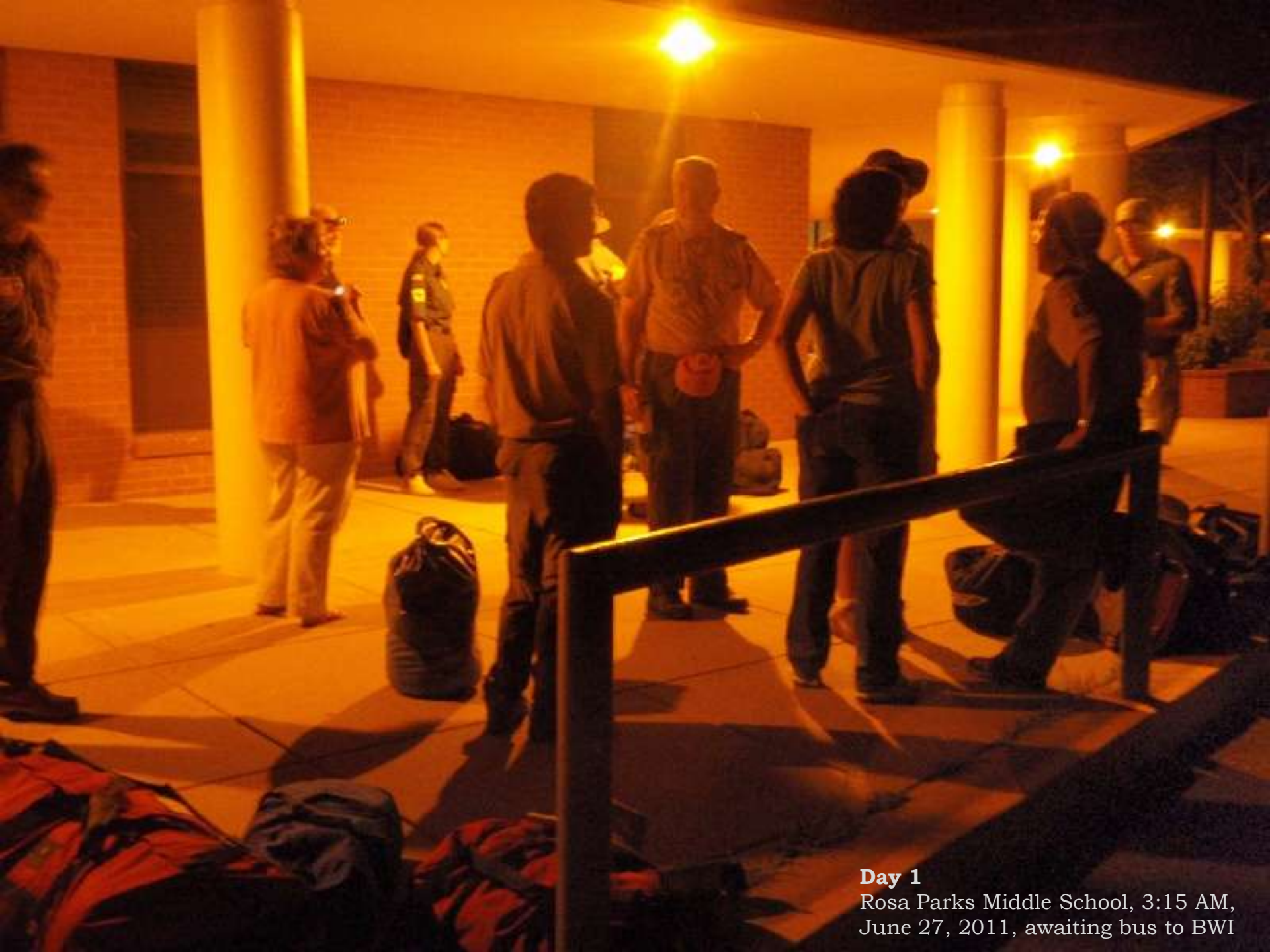
Day 1 Rosa Parks Middle School, 3:15 AM, June 27, 2011, awaiting bus to BWI