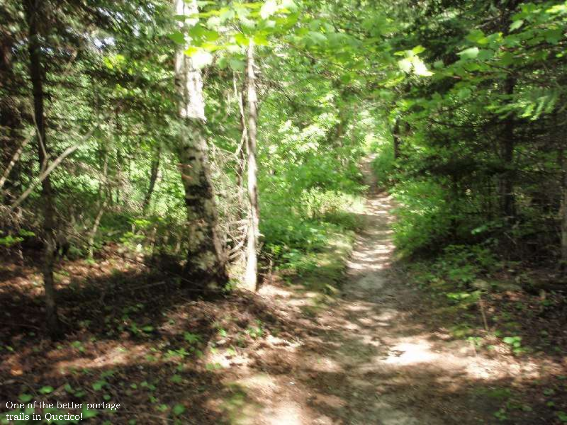
One of the better portage trails in Quetico!