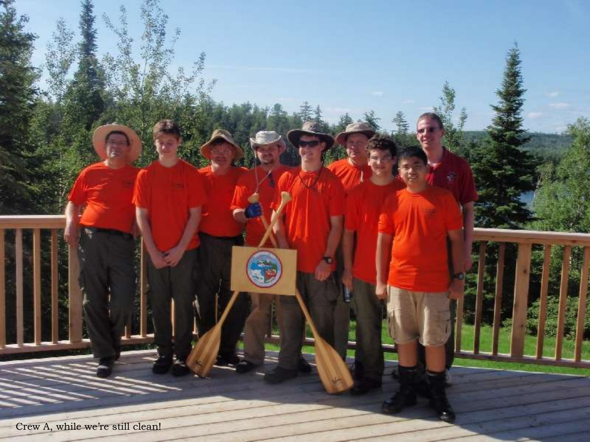
Crew A, while we're still clean!