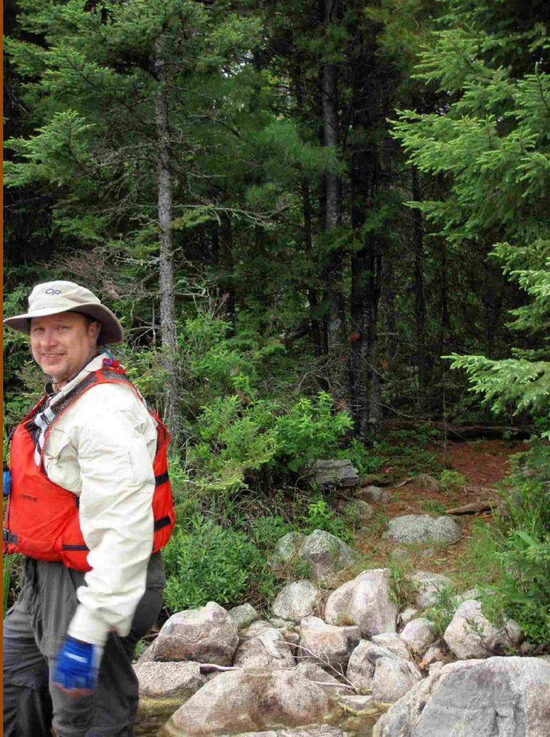
Portage to Dell Lake