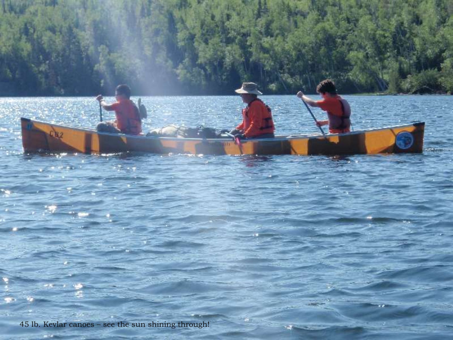
45 lb. Kevlar canoes – see the sun shining through!