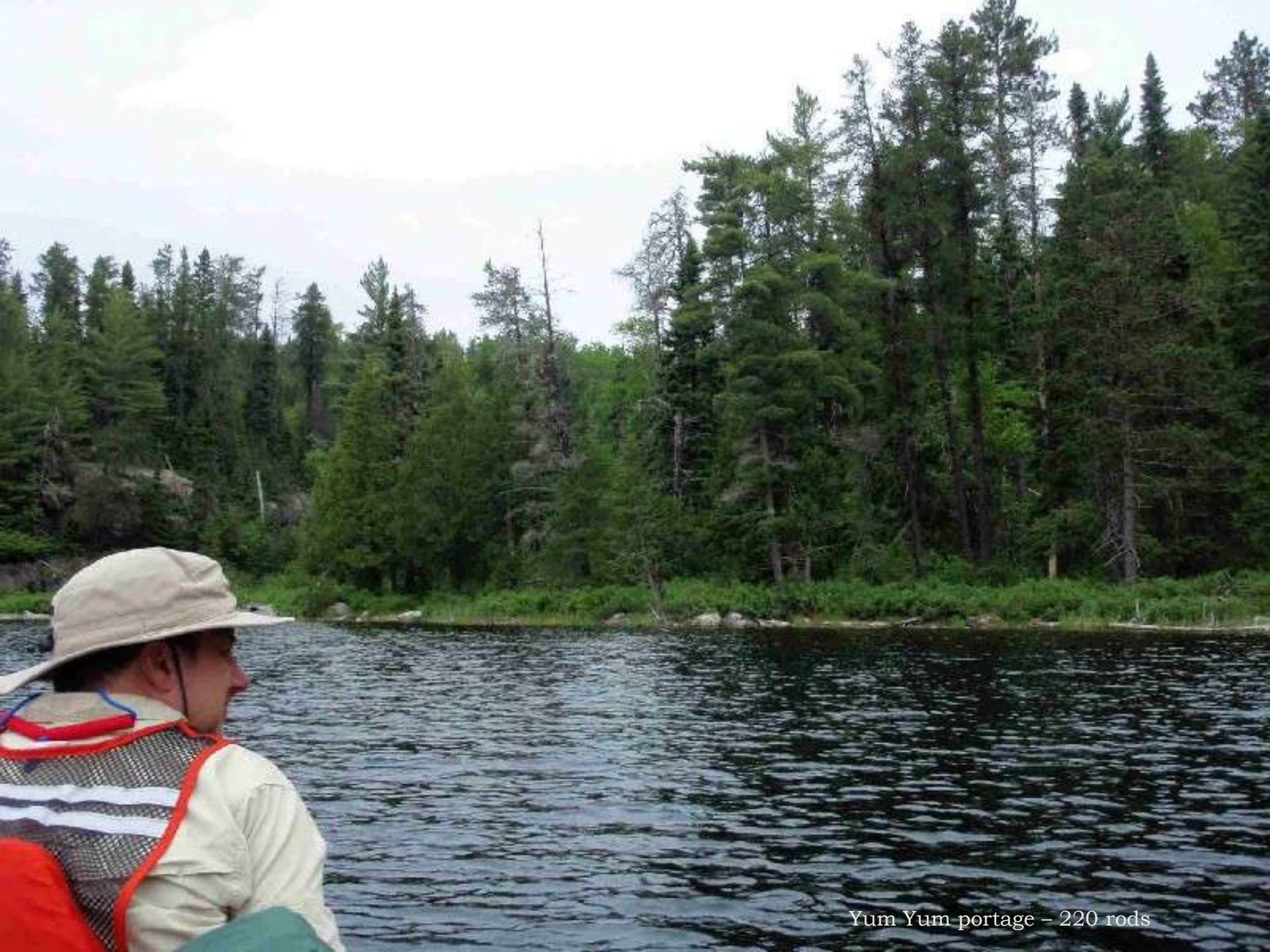
Yum Yum portage - 220 rods