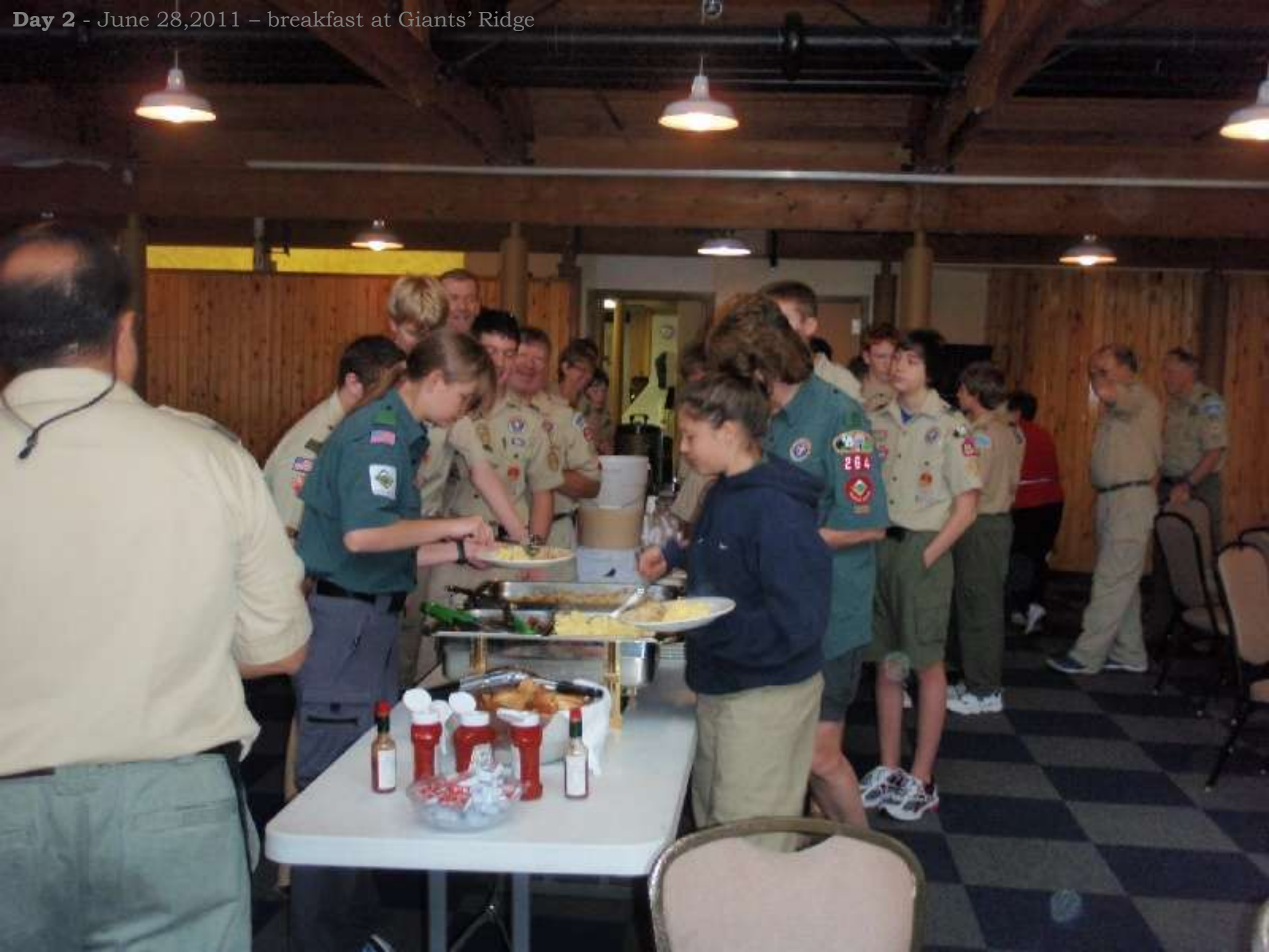
Day 2 - June 28, 2011 - breakfast at Giants' Ridge