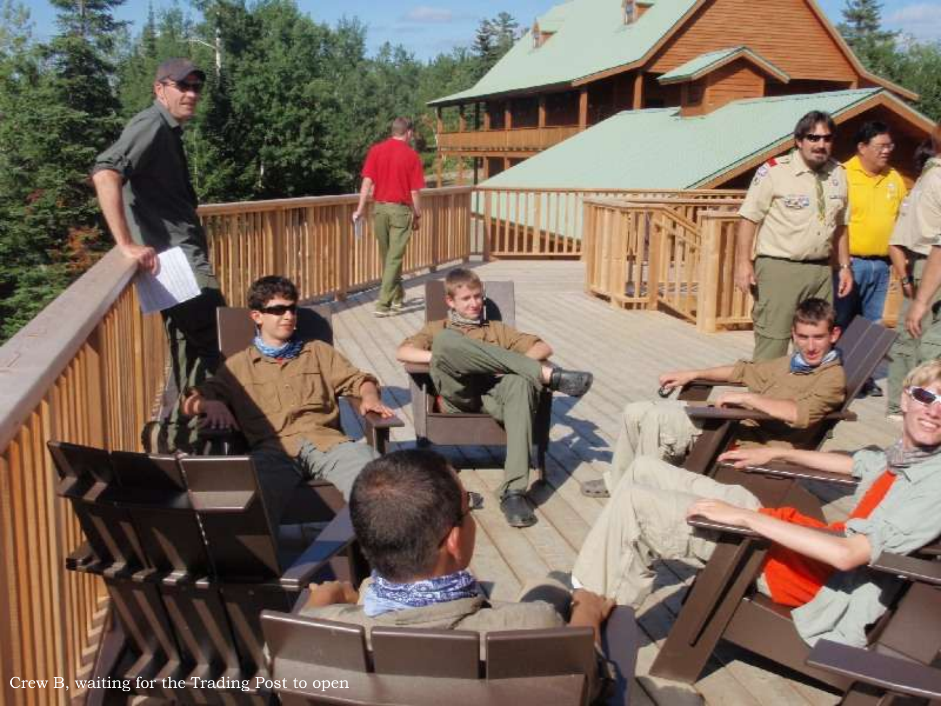
Crew B, waiting for the Trading Post to open