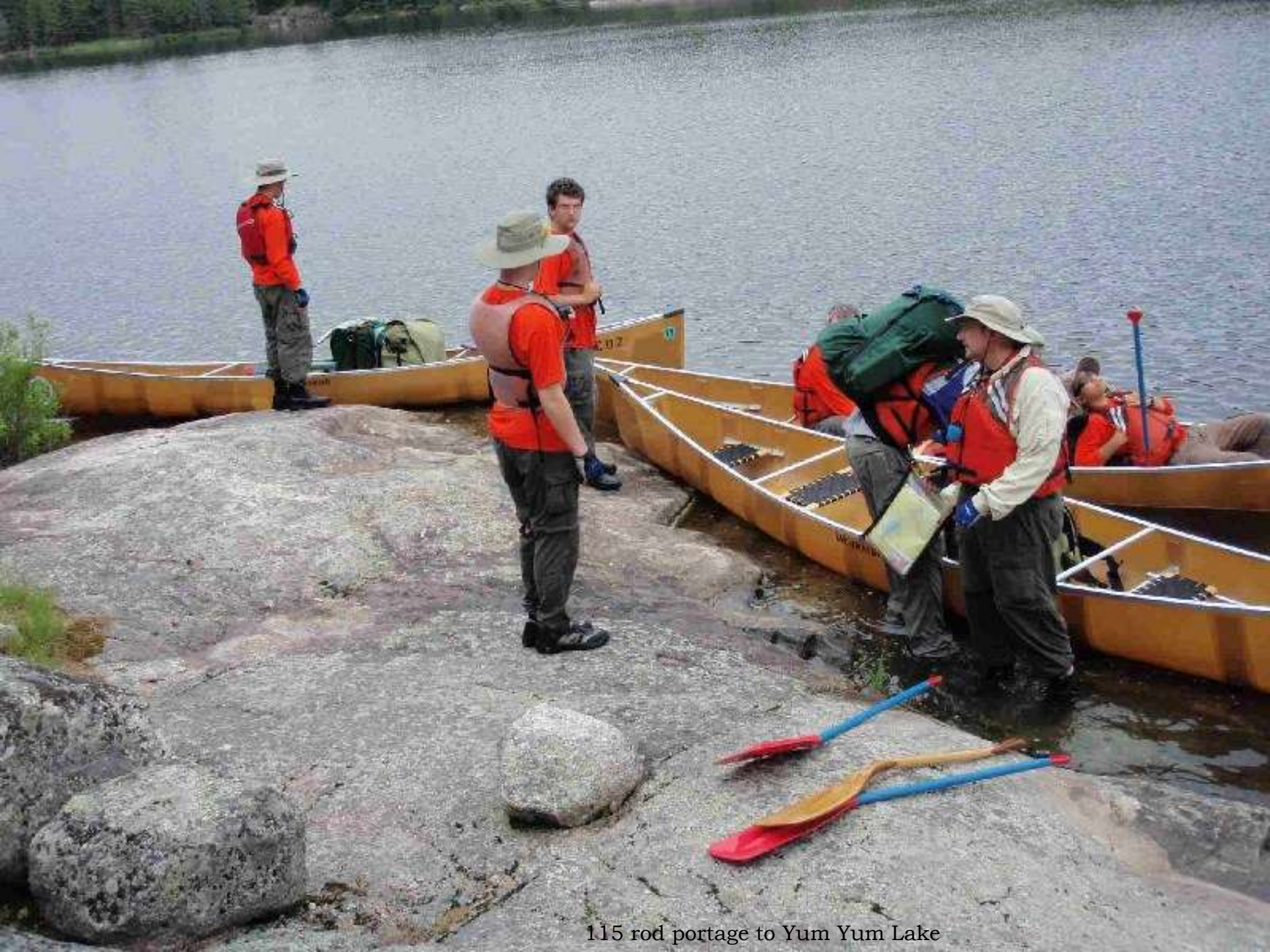
115 rod portage to Yum Yum Lake