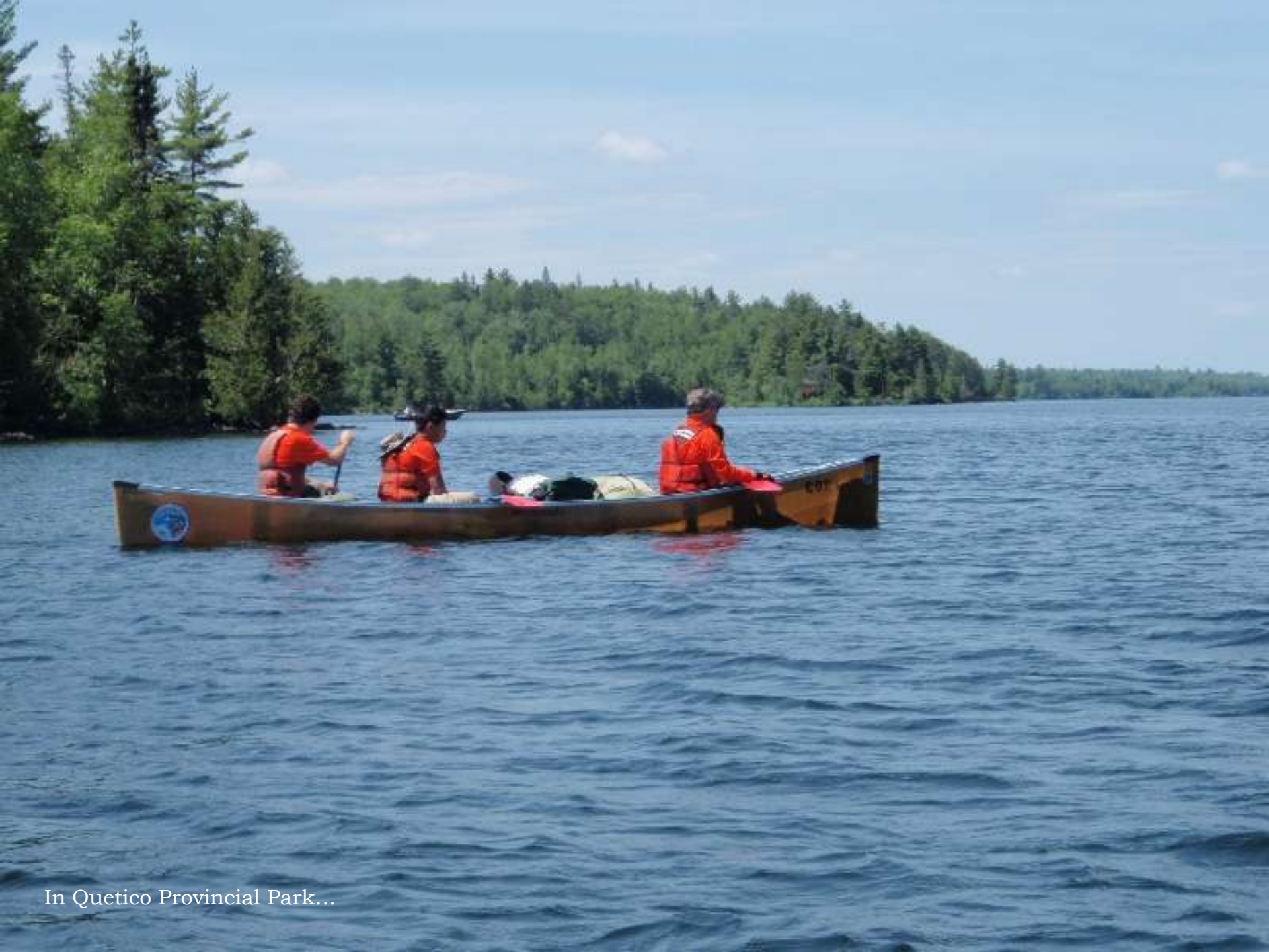
In Quetico Provincial Park...