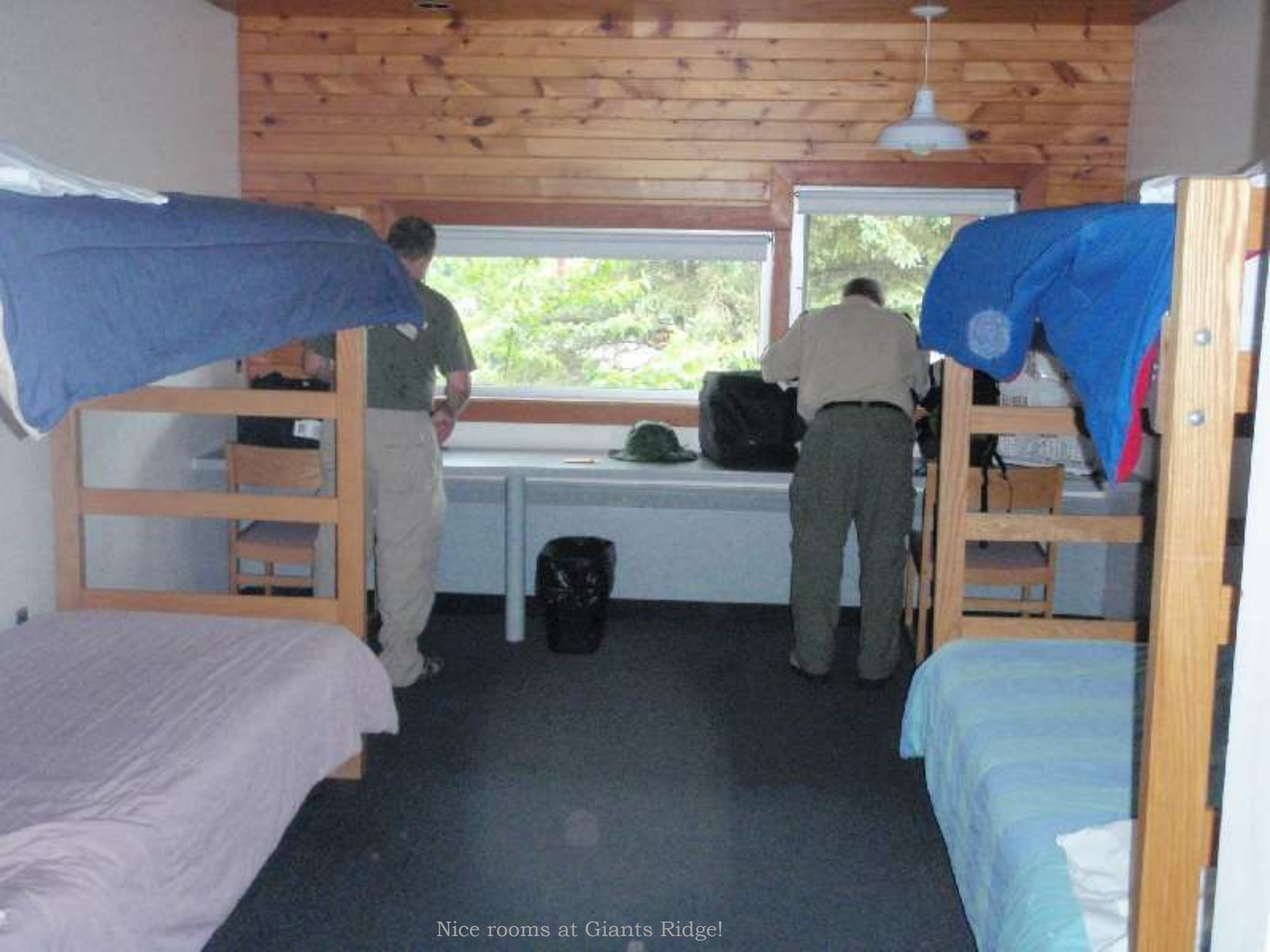
Nice rooms at Giants Ridge!