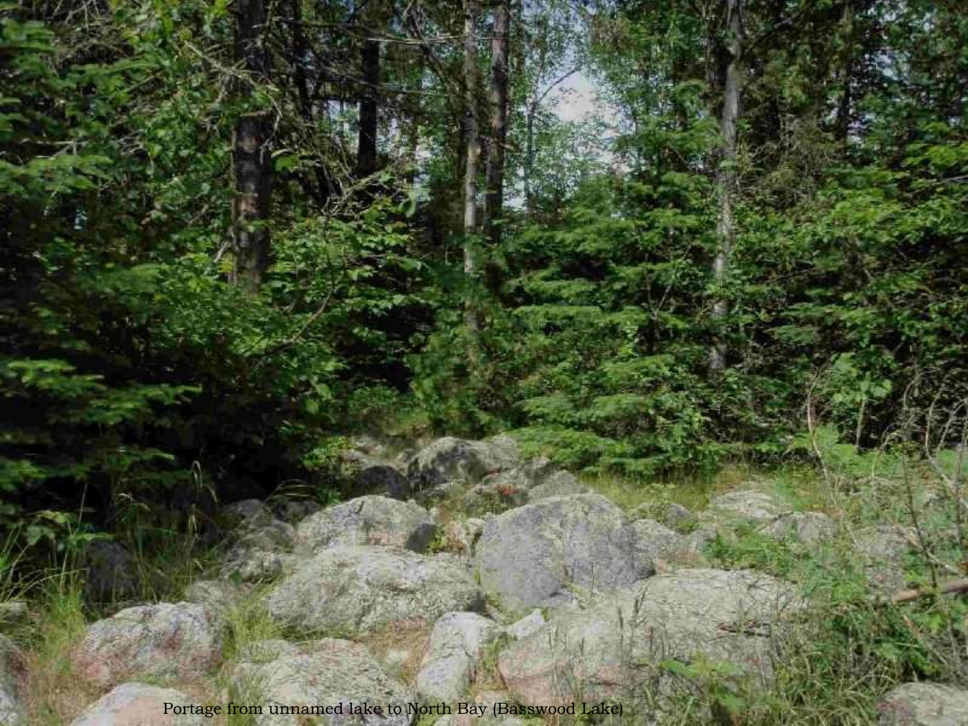
Portage from unnamed lake to North Bay (Basswood Lake)