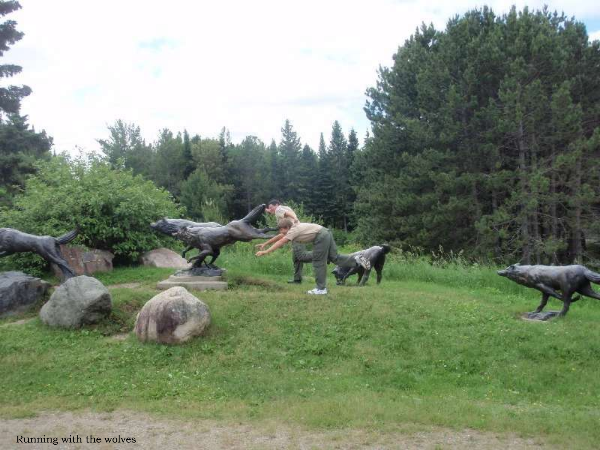
Running with the wolves