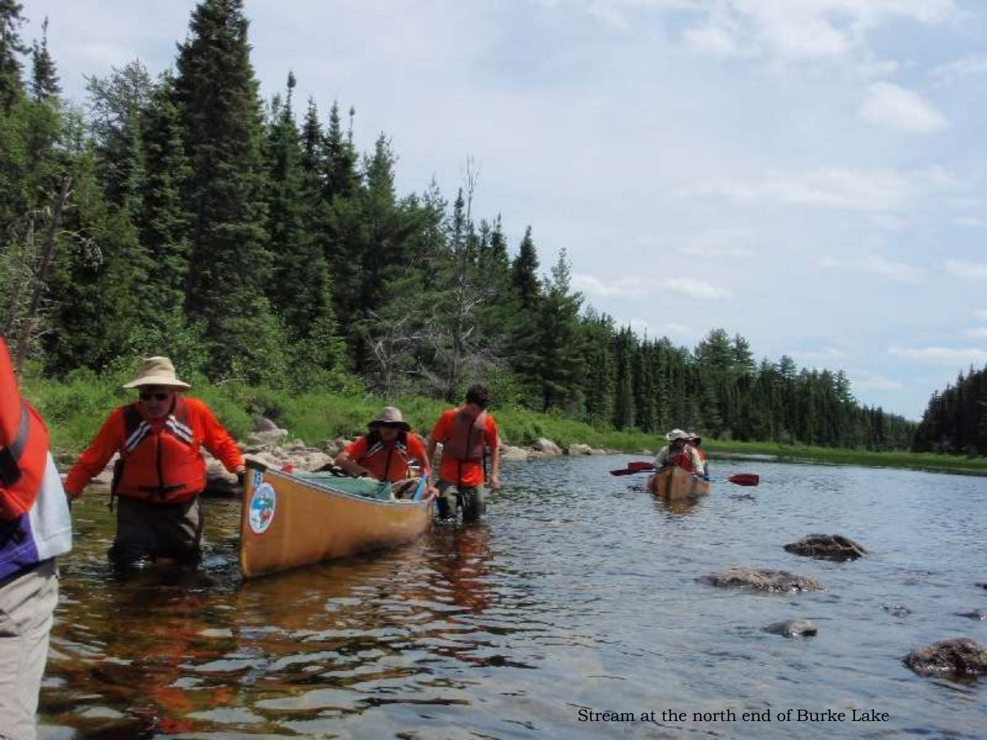
Stream at the north end of Burke Lake