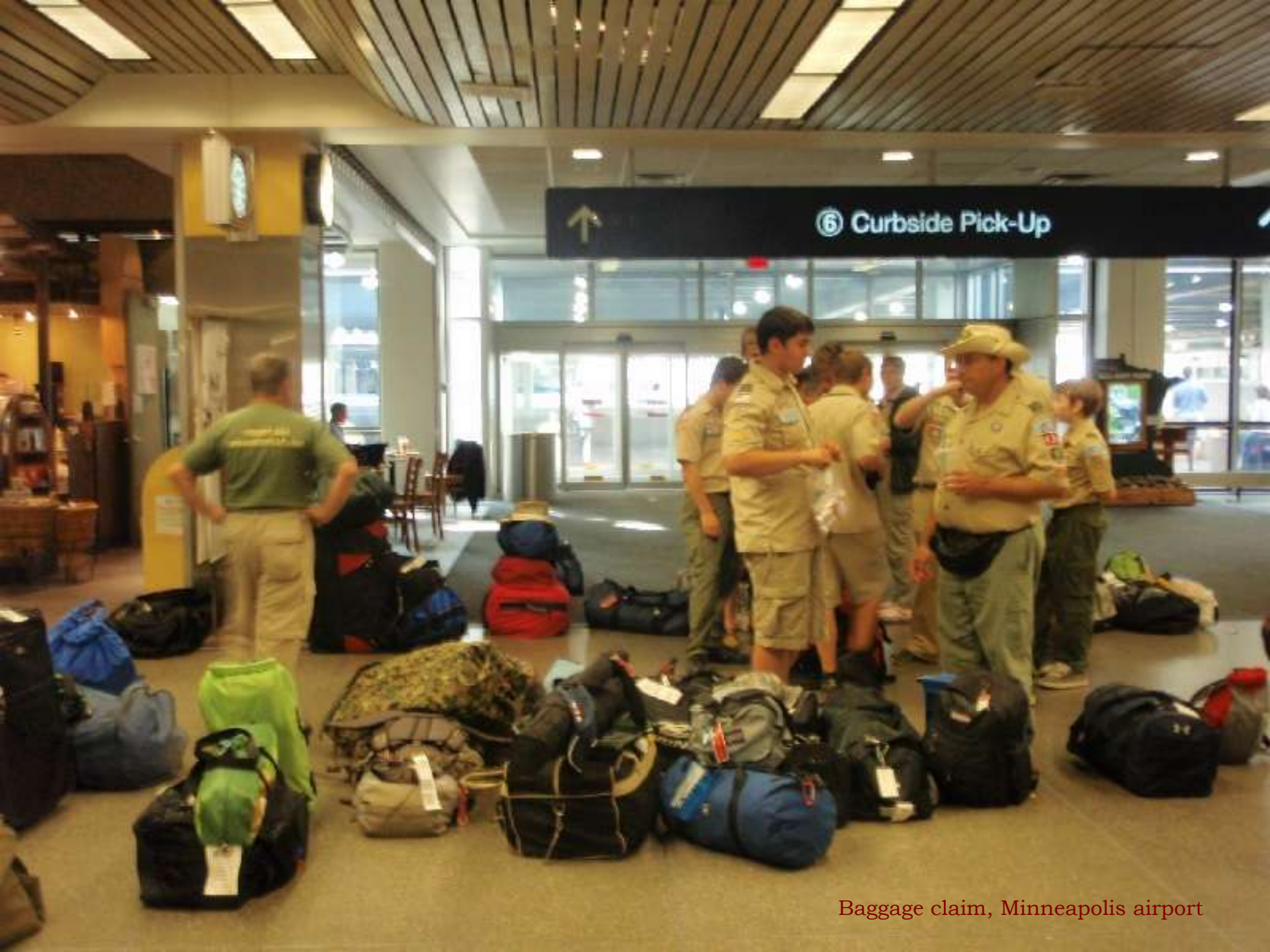
Baggage claim, Minneapolis airport