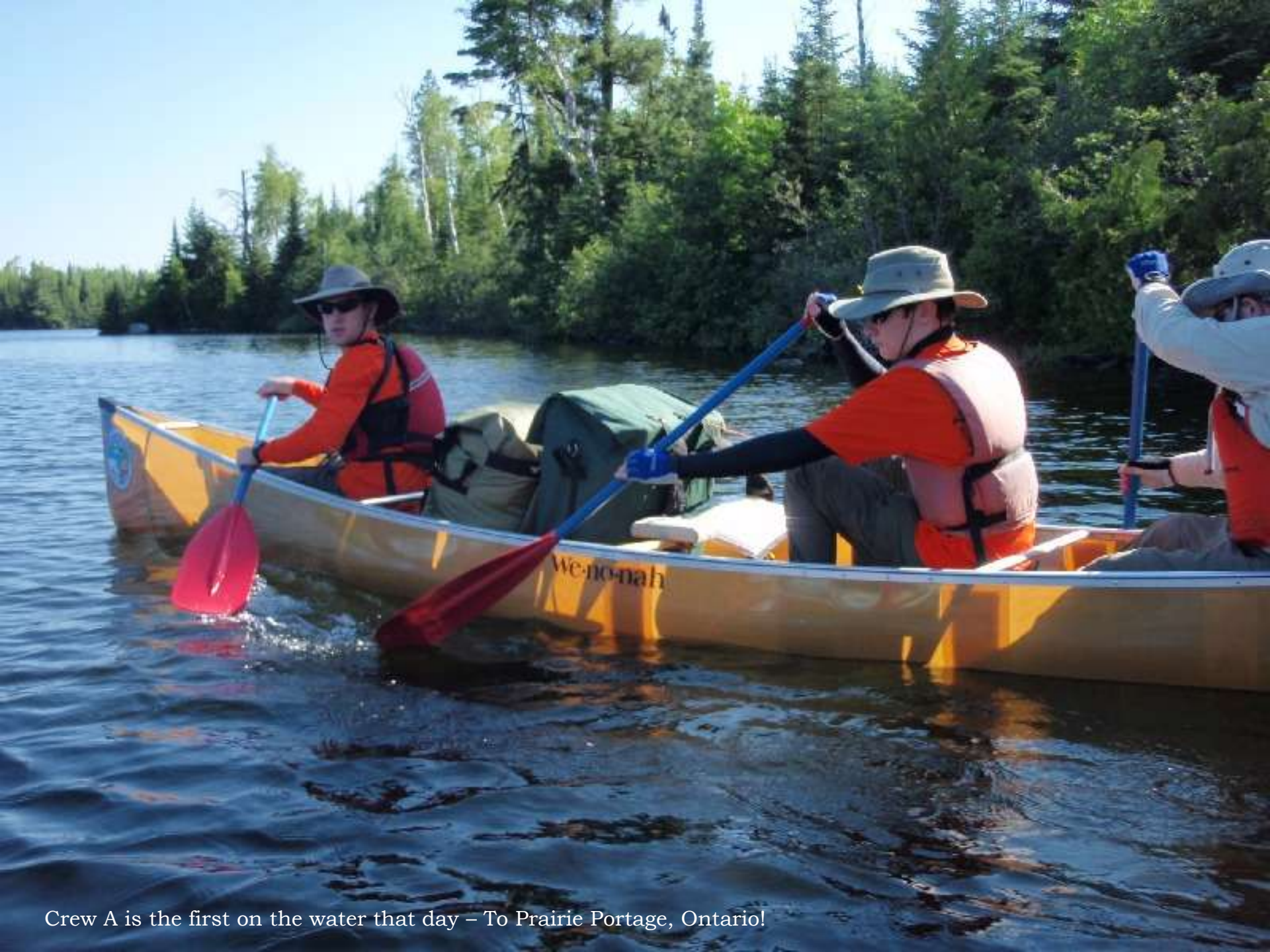
Crew A is the first on the water that day – To Prairie Portage, Ontario!