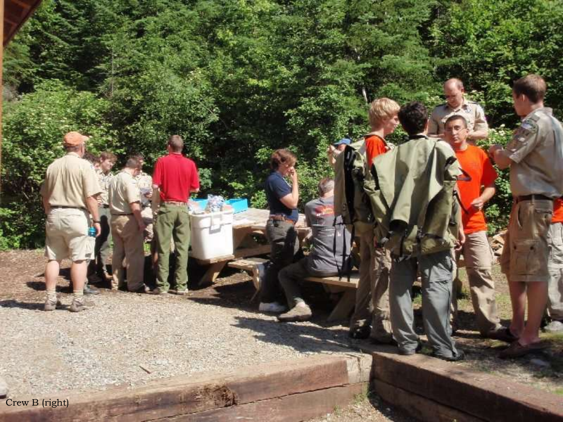
Crew B (right)