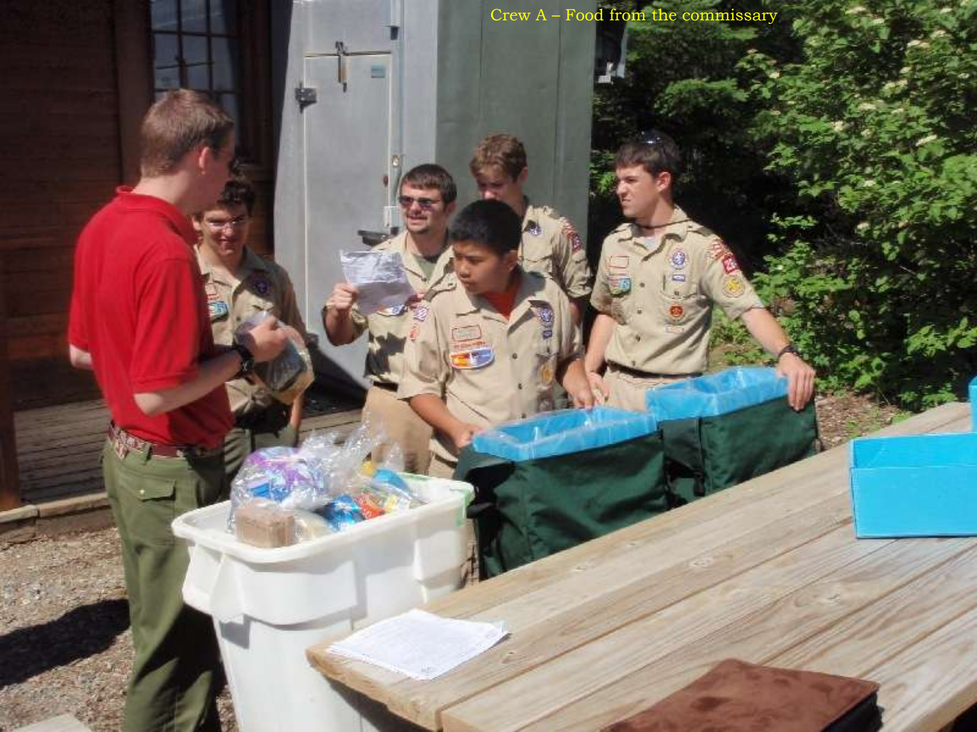
Crew A – Food from the commissary