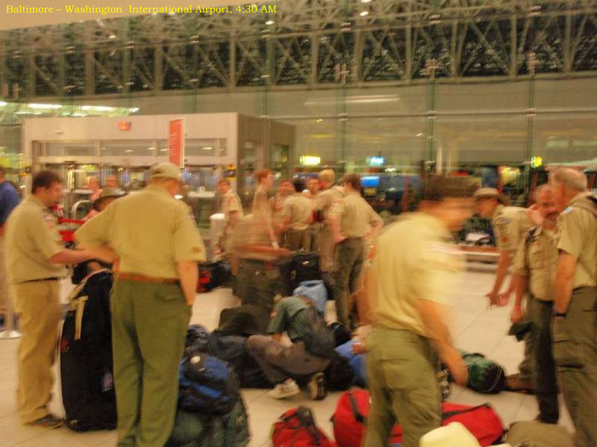
Baltimore – Washington International Airport, 4:30 AM