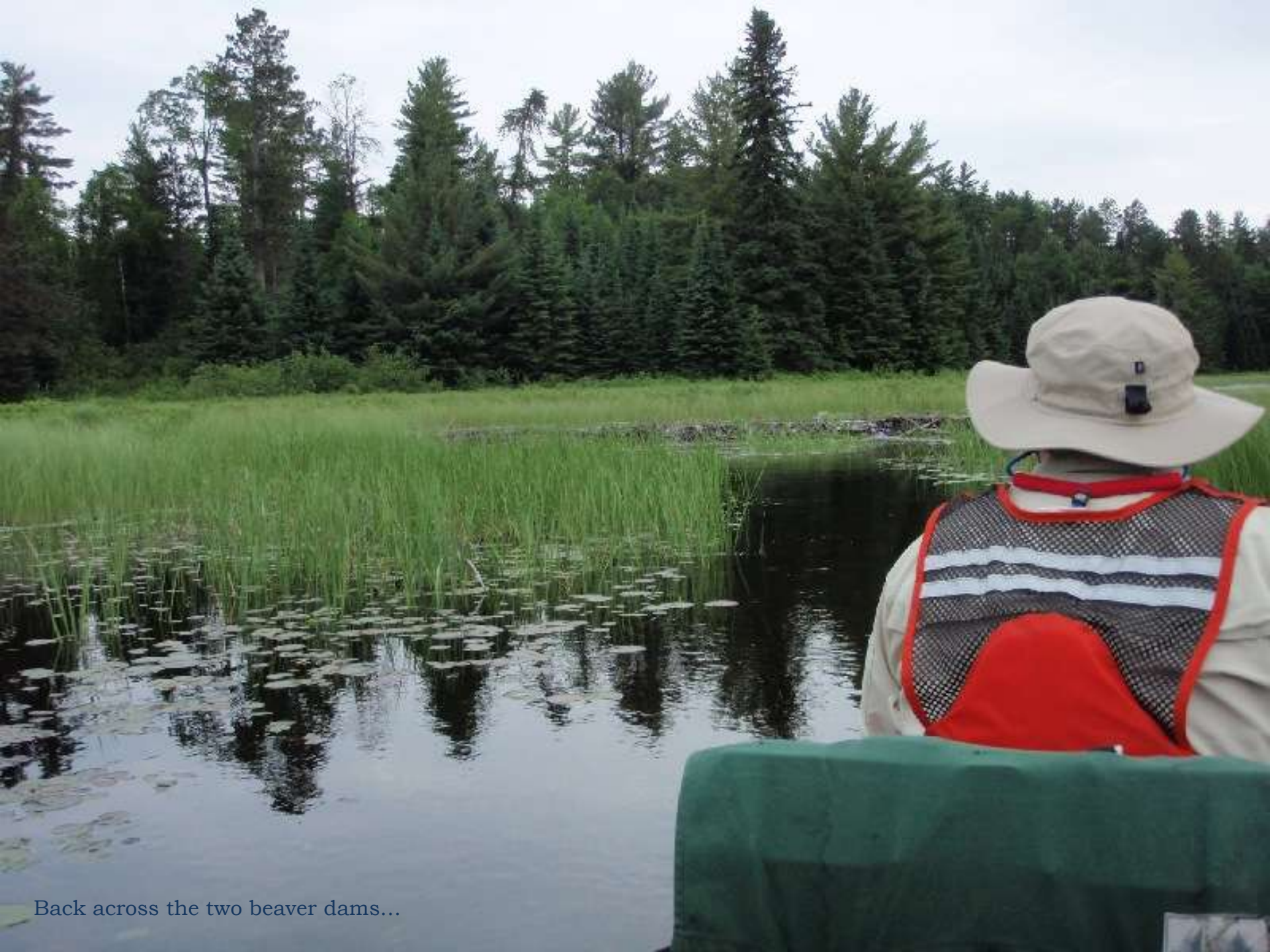
Back across the two beaver dams...