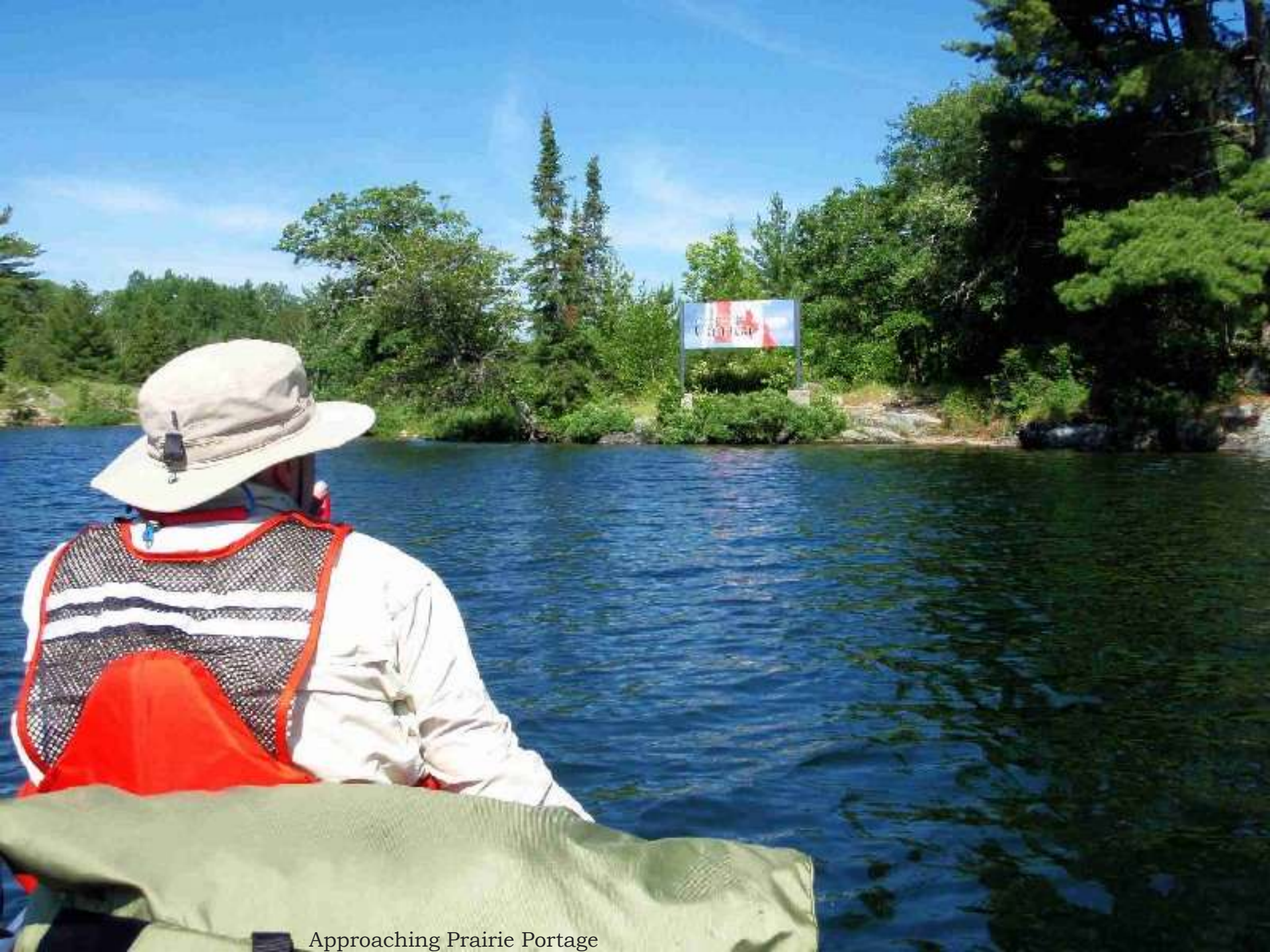
Approaching Prairie Portage