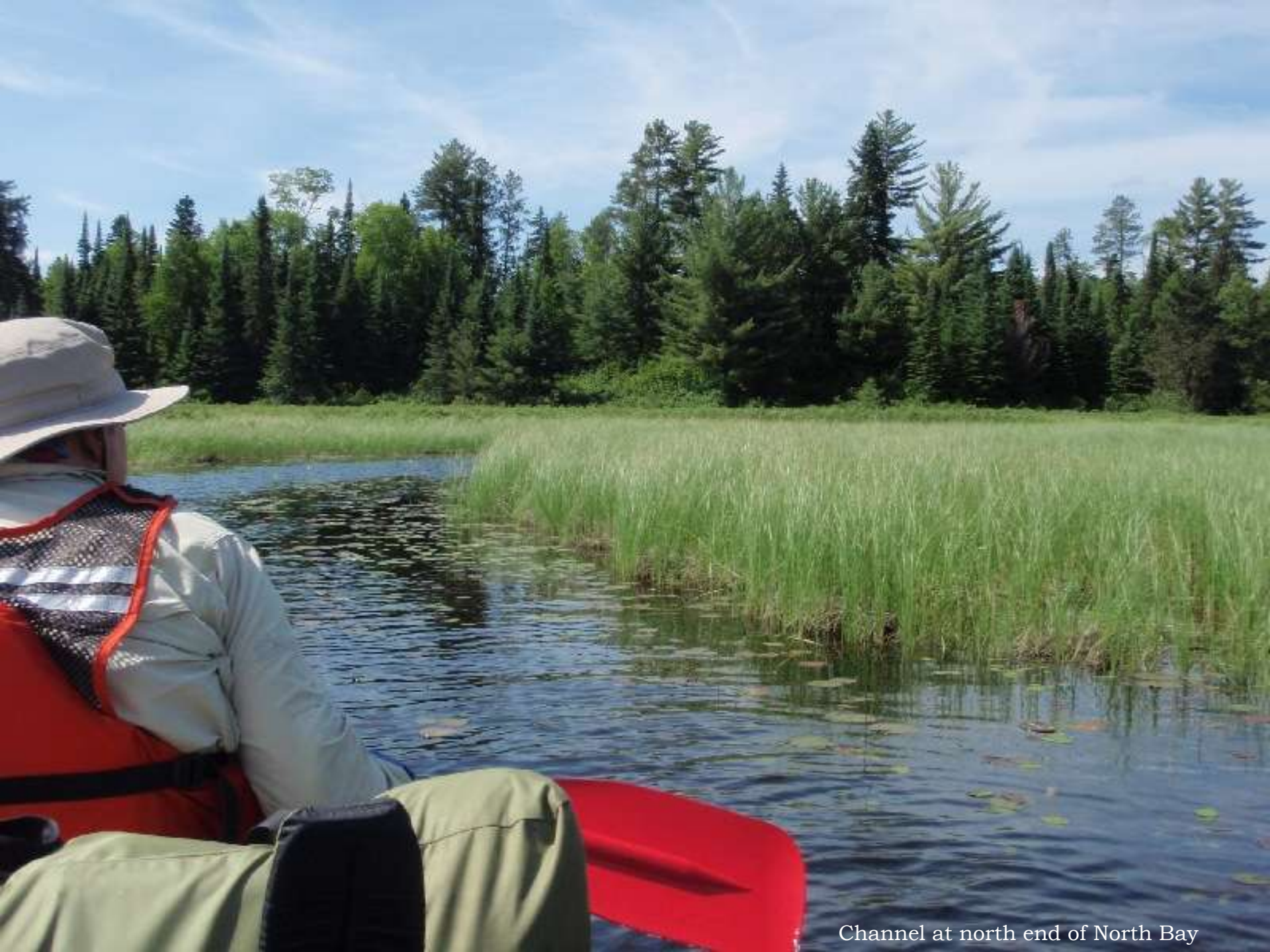
Channel at north end of North Bay