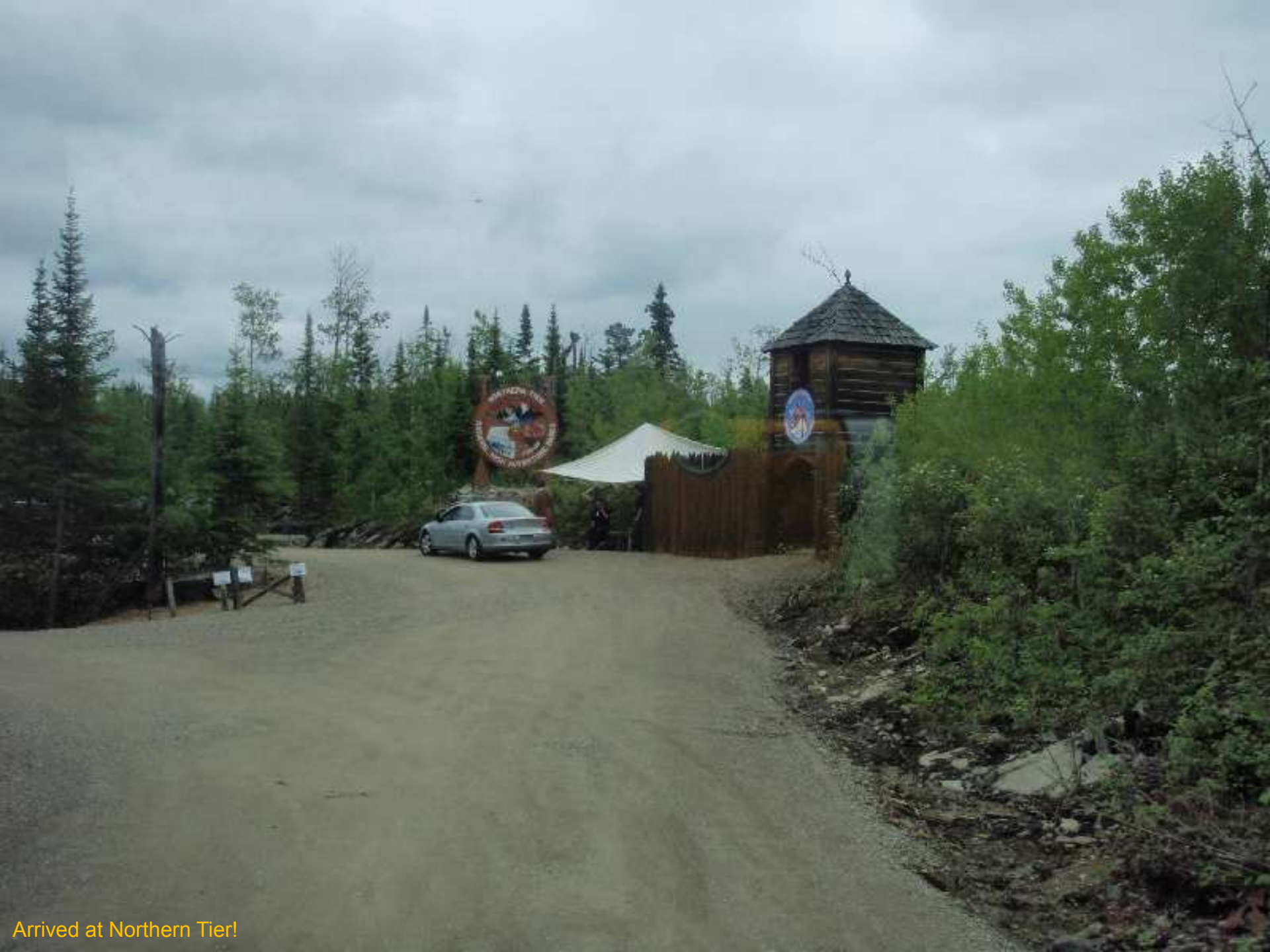
Arrived at Northern Tier!