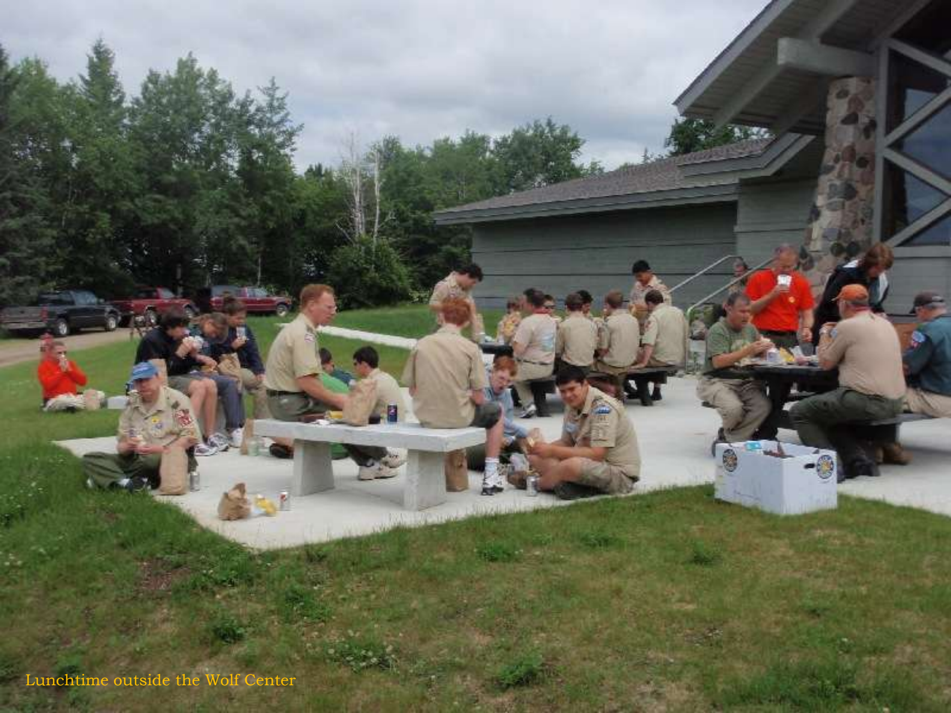
Lunchtime outside the Wolf Center