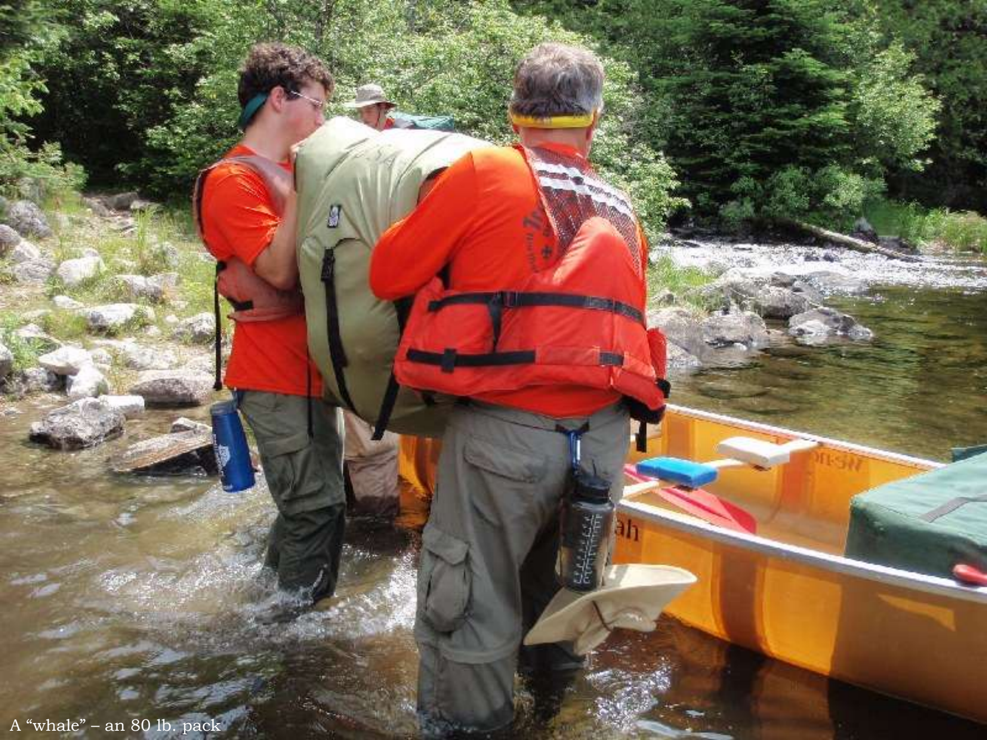
A “whale” – an 80 lb. pack