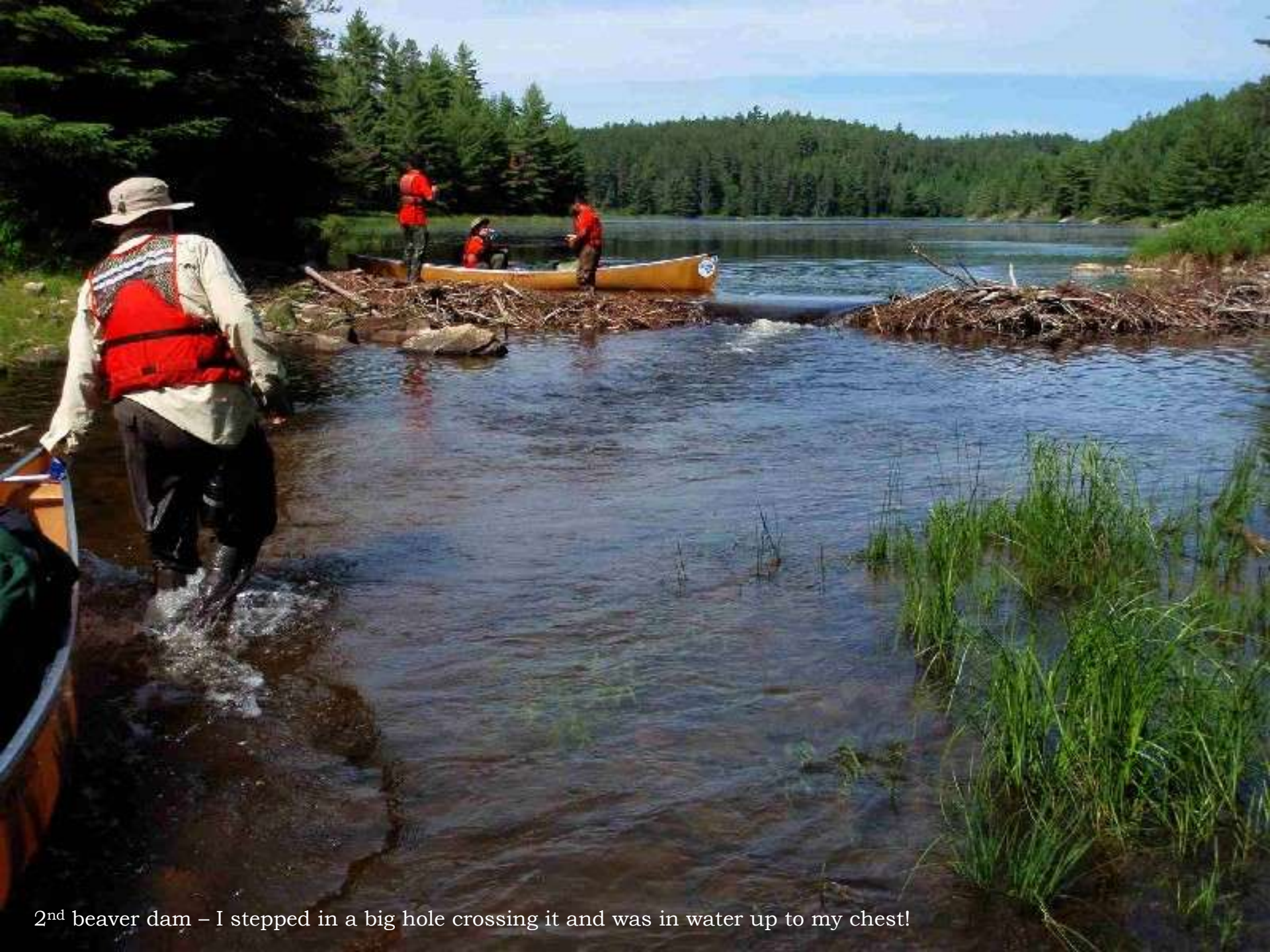
2 nd beaver dam – I stepped in a big hole crossing it and was in water up to my chest!